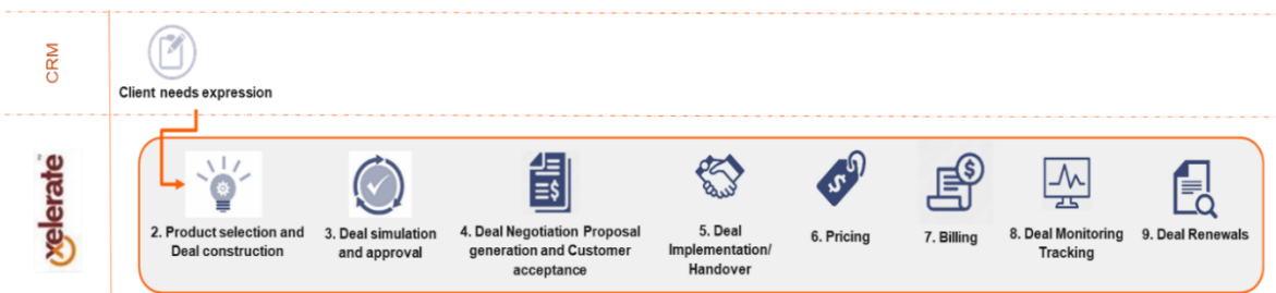
Automating the deal management cycle