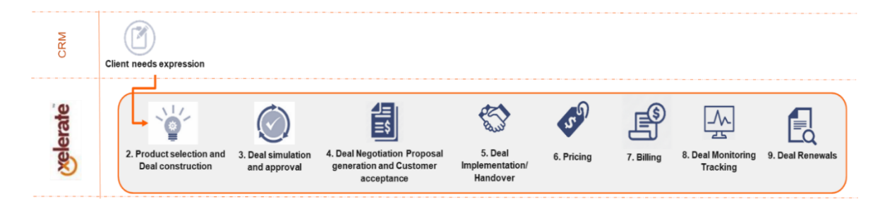
Automating the deal management cycle