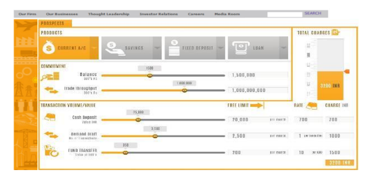
Giving control to the customer to drive their relationship with the bank